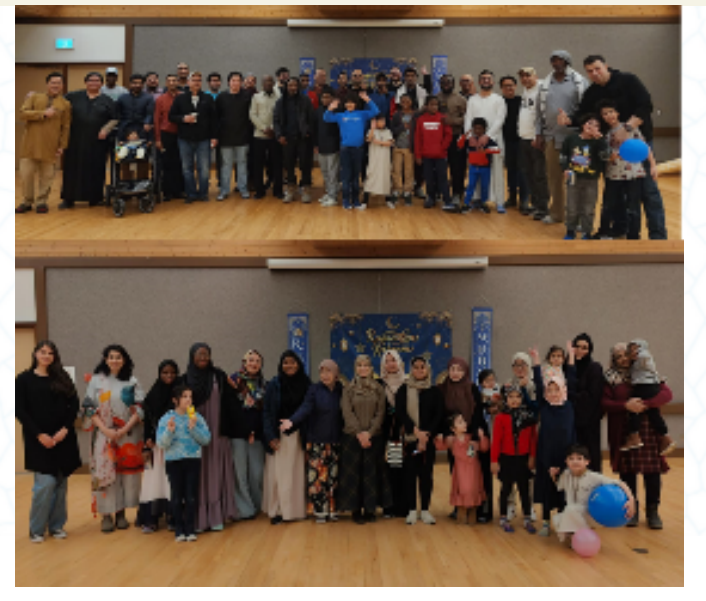
Ramadan 2024 Over 100 attendees!

Your generous donation will help us build the first Islamic center in Kitimat, a growing community that is becoming a hub for Muslims from all over the world. Together, we can create a space for prayer, education, and community, providing essential religious and cultural support for Muslims in Northern British Columbia.