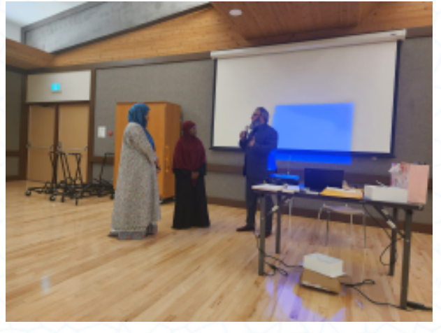
Two Reverts to Islam in 2024